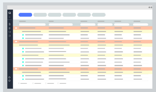
SoA (STATEMENT OF APPLICABILITY)