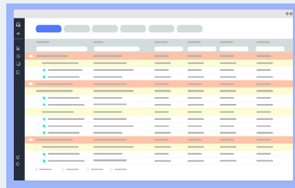
SoA (STATEMENT OF APPLICABILITY)