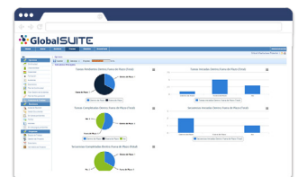
← Testing program